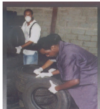
Tyre Inspectors at work

From October 1st 2004, The Saint Lucia Bureau of Standards will begin implementing its tyre inspection program. Inspection will be done in the presence of the Tyre Importer or his/her agent and a Customs Officer. All Used Tyres will be inspected whereas a representative sample of New Tyres will be inspected.