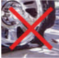
Unsafe Tyres can cause

The Compulsory Standards Compliance Programme of the Saint Lucia Bureau of Standards is designed to ensure that products sold in St. Lucia, for which compulsory standards exist, conform to acceptable standards pertaining to health, safety, performance and labelling. This programme applies to products which are manufactured locally as well imports. Tyres is one such product.